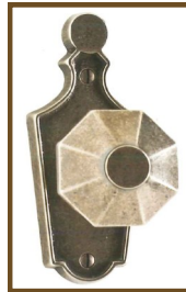
The Roger Thomas Paris Collection

We are really excited about the three new collections being introduced by Rocky Mountain! First, the