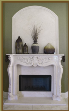
Marseille Fireplace Surround & Over Mantel

Add a bold touch of elegance to your fireplace with this stunning fireplace surround and over mantel. This specific